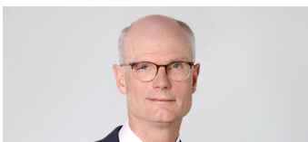
Stef BLOK Netherlands