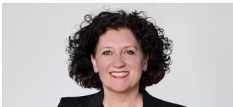
Annemie TURTELBOOM Belgium