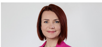
Keit PENTUS-ROSIMANNUS Estonia