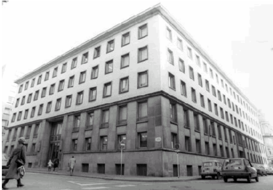
Former seat of the European Court of Auditors (Luxembourg)

The Treaty of Nice of 1 February 2003 confirmed the principle that there should be one Member from each Member State, allowed the Court the option of establishing internal chambers and stressed the importance of cooperation between the Court and the national audit institutions.