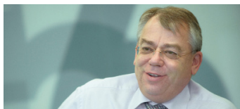
Klaus-Heiner LEHNE Germany