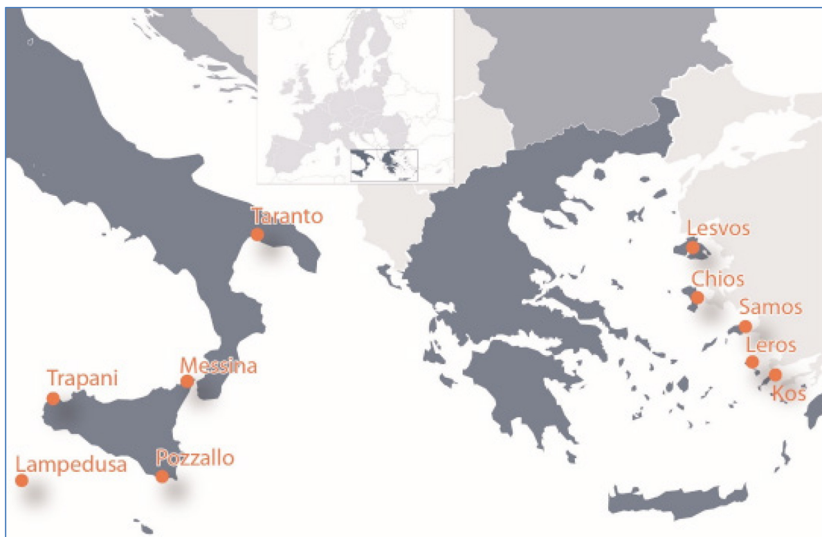
Figure 1 – EU “hotspots” in Greece and Italy