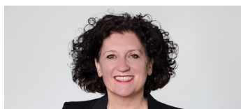
Annemie TURTELBOOM Belgium