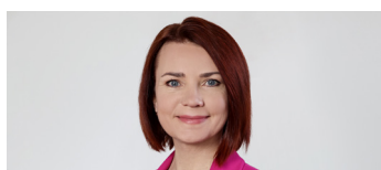
Keit PENTUS-ROSIMANNUS Estonia